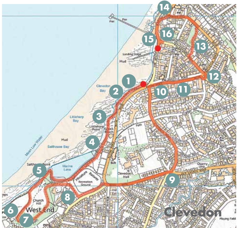
You are not permitted to copy, sub-license, distribute or sell this data to third parties in any form.